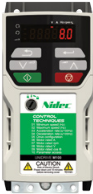
Unidrive M100 Frame Size 1

The Unidrive M100 series was developed in response to increasing customer requests for an easy-to-use, compact, cost-effective general purpose AC drive. This drive provides outstanding V/Hz and open loop vector performance up to 10 HP, has a bright, easy to read LED keypad and has an optional parameter copy device. The Unidrive M101 variant features an LED keypad with a speed reference potentiometer.