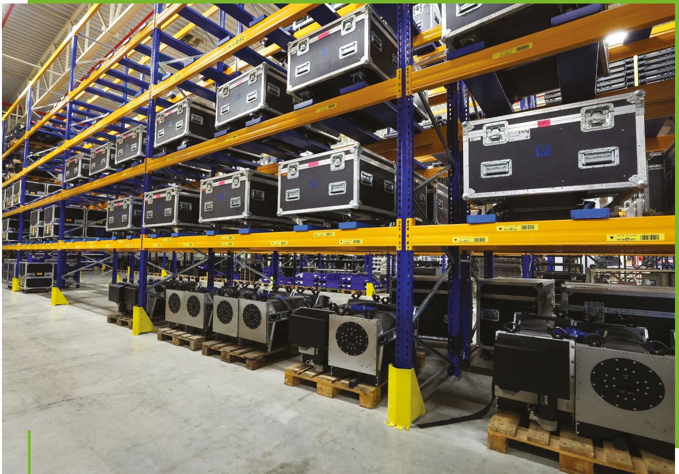
The completed systems ready and waiting to depart Belgium for stages worldwide