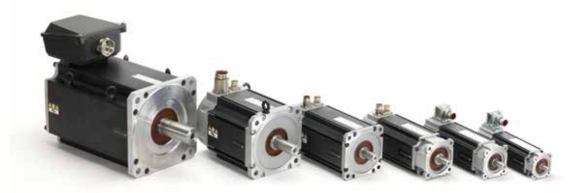
The Unimotor fm family ranges from 75 mm to 250 mm