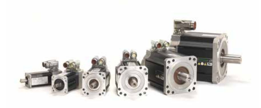
The Unimotor hd family ranges from 55 mm to 190 mm

Unimotor hd has a high power to weight ratio, meaning that it can be easily integrated into the smallest, most demanding applications such as industrial robotics, pick & place and packaging.