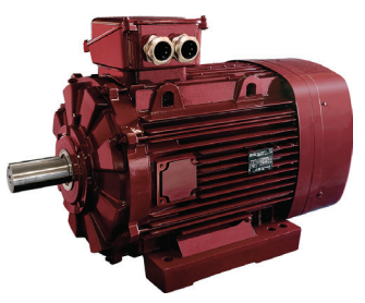
DYNEO LSRPM Permanent Magnet Motor to 750 HP (600 kW)