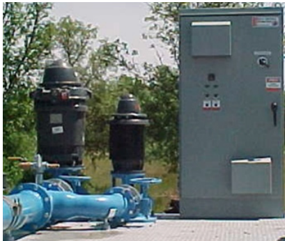
Outdoor NEMA 3R multiplex pump solution

Unidrive M400 pump control systems include the multiplex pump solution pre-programmed with pump control software and parameters to significantly reduce costs through measurable improvement in pumping reliability, up-time and performance.