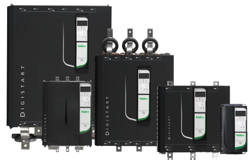
Digistart D3 Family