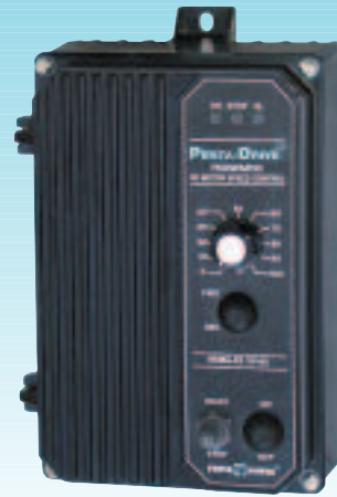
Model KBRC-240D KB Part No. 8840 (Black Case) KB Part No. 8841 (White Case)