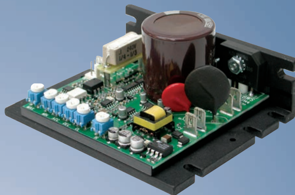
Model KBWS-15 Shown