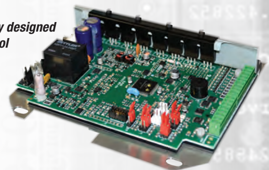
Newly designed control