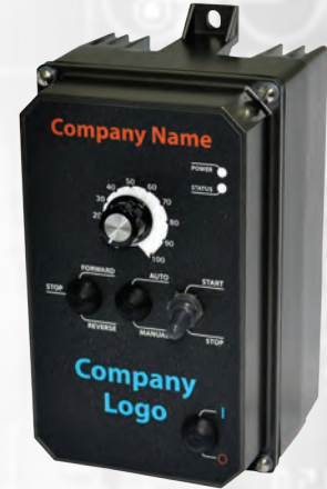
Custom label or branding

Depending on production order size, samples will be supplied along with a quotation.