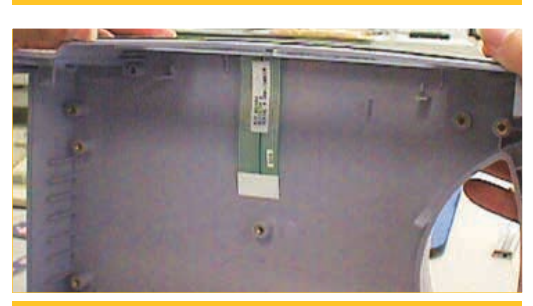
Figure 8: Detail side view: showing 0.040"polycarbonate template matching curve of well-mount in plastic casing.