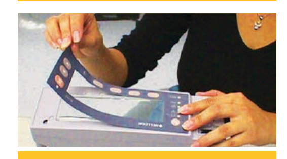
Figure 5b: NEVER roll the membrane switch onto casing or wellmount on bezel.