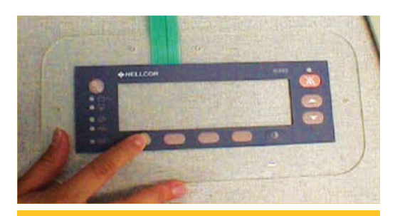
Figure 2b: Detail view: tactile membrane switch is laying flat in proper test fixture during test key actuation.