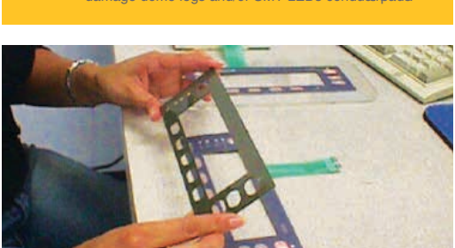
Figure 7b: Align template over membrane switch for proper orientation.