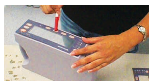
Figure 10: Even after assembled, NEVER actuate keys with hard object. Only actuate keys with human finger-tip.