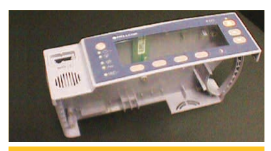
Figure 12: Finished part laminated to typical customer casing. Membrane switches may ONLY be laminated to substrate ONE time. VIS can not warranty parts that have been removed and/or repositioned for final assembly.