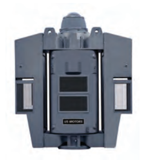
TITAN<sup>®</sup> Vertical WPII Motor

Mena manufactures more than 5800 motors annually; 70% are highly specified engineered-to-order products