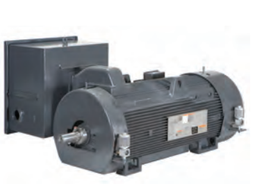
TITAN<sup>®</sup> Horizontal TEFC Motor