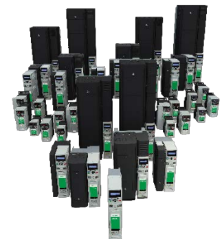
Unidrive M AC/Servo Drives

Please visit our Upgrade Assistance page for product upgrade assistance and contact information.