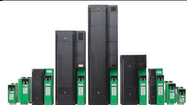
Commander C200 AC Drives

Please visit our Upgrade Assistance page for product upgrade assistance and contact information.