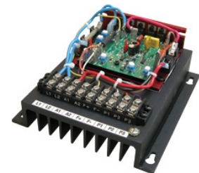
Unidrive M AC/Servo Drives

Please visit www.kbelectronics.com for product and contact information.